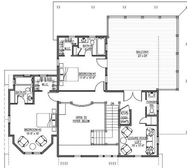
HOUSE E SECOND FLOOR PLAN - 1,074 G.S.F. SCALE: 1/8" = 1'-0"