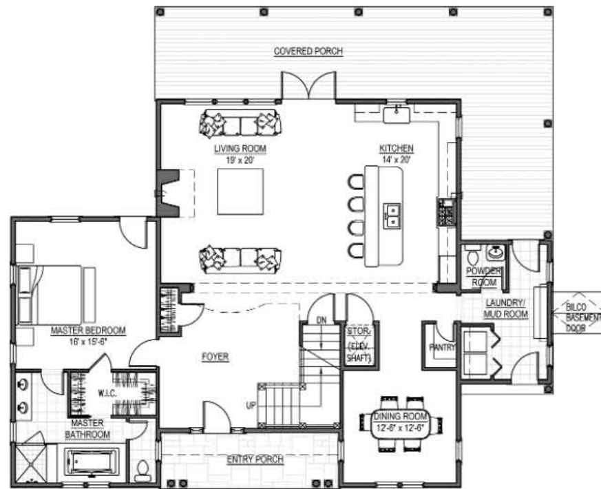
HOUSE E FIRST FLOOR PLAN - 1,945 G.S.F. SCALE: 1/8" = 1'-0"